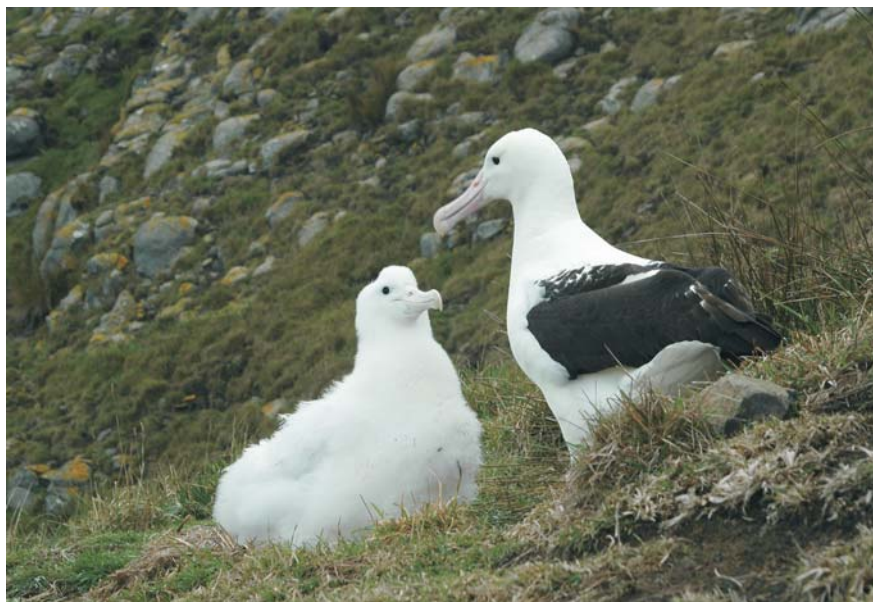
Northern Royal Albatross

As well as the albatross, many other local animal species are also in the middle of their breeding season....including: fur seals, spoonbills, red-billed gulls, spotted shags, Stewart Island shags and blue penguins. Guided tours are available daily, on 0800528767 or reservations@albatross.org.nz for bookings.